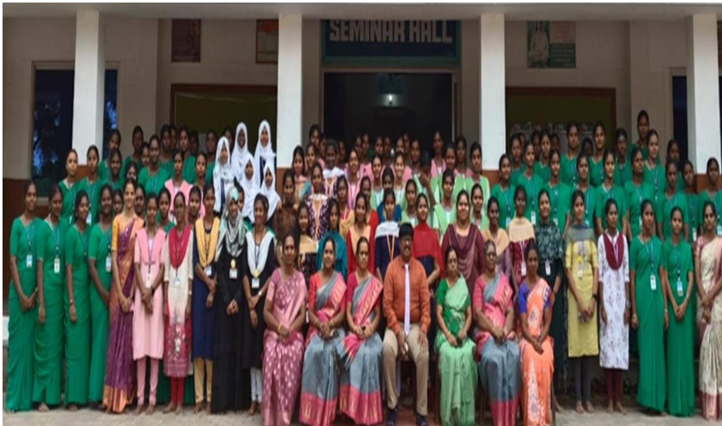
Participation in the National Conference by the students of Chemistry on "Multi-disciplinary Research in Chemistry" in Sri Sarada College for Women, Tirunelveli