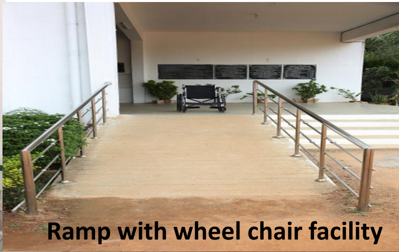
Ramp with wheel chair facility