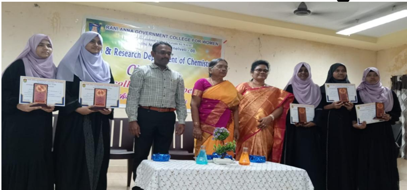
Students' Participation in the Inter College Competition CHEMFEST 2026 organized in Rani Anna College for Women