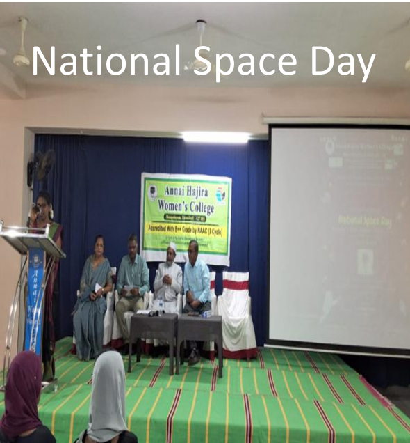
National Space Day